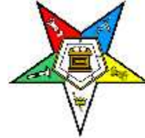
Silver Reef Chapter #26