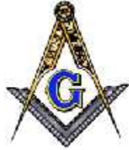
Saint George Lodge #33